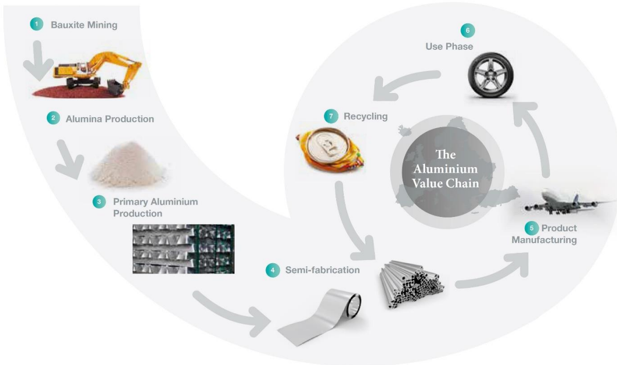
ALUMINUM LIFE CYCLE

The industry recycles all the aluminum scrap it can obtain from end-of-life products and aluminum by-products. New scrap is collected almost in its entirety, as collection is in the hands of the aluminum industry. The collection of aluminum at end-of-life depends, however, on consumer initiative to collect aluminum for recycling, as well as the co-operation of industry, legislators and local communities to set up efficient collection systems.